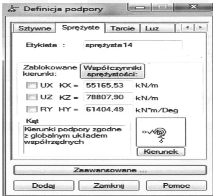
Fig. 2. The definition of the elastic support in Robot

Soil – structure interaction was taken into account with using elastic foundation (Fig. 2). Elastic foundation takes into account possibility of settlement occuring and makes model of foundation more realible. After including soil conditions (types of soil in different stratum) the Robot soil-calculator gives as a result value of substitute modulus of elasticity of soil in z-direction called Kz. Values of substitute modulus of elasticity of soil in x and y-direction were calculated according to rules enclosed in [8].