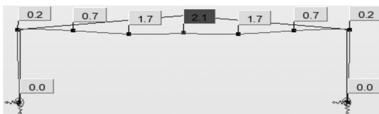
Fig. 4. Second mode shape of variant I