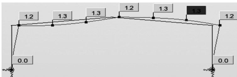
Fig. 3. First mode shape of variant I