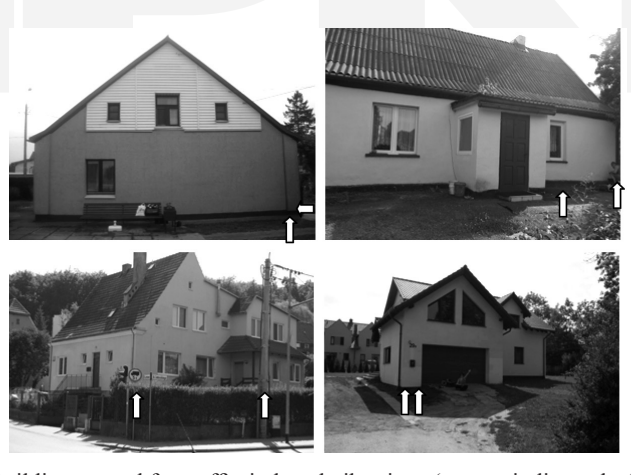
Fig. 1. Buildings tested for traffic-induced vibrations (arrows indicate the locations of vibration sensors)

In this study, the vibration field measurements taken on four residential buildings are presented (Fig. 1). The source of vibrations was related to the movements of vehicles with varying tonnages and number of axles, travelling at different speeds. For each building, a series of several tests was conducted. As the outcome of the tests, after the analysis in 1/3 octave bands, authors received about 400 results for each building. The peak values were selected and plotted on Dynamic Influence Scale I graph (DIS I). Fig. 2 and Fig. 3 show examples of graphs of peak accelerations with respect to the centre frequencies. After performing an analysis consistent