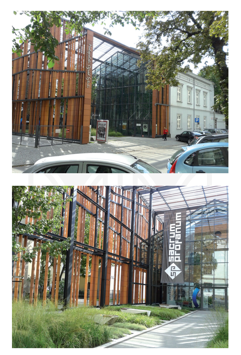
Ill. 4-5. Malopolski Garden of Art

of hundred-year-old brick, the architects wished to create an oasis of peace and quiet. It is a wonderful example of inscribing a new form into the historic urban tissue using modern materials. An openwork glass and metal umbrella roof invites pedestrians to go inside, where a theatre, a multimedia library, exhibition halls, and a coffee shop can be found. The external glass walls reflect the surrounding trees and tall grass like a mirror.