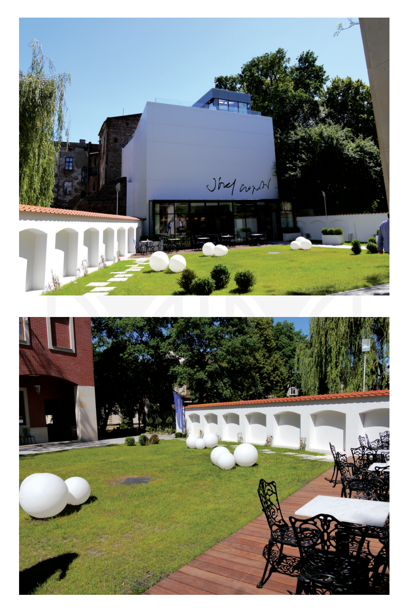
Ill. 9-10. Emeryk Hutten - Czapski Museum