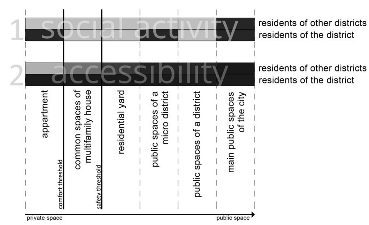
Fig. 2. Social activity (1) and accessibility (2) of a city structure for the residents of the definite district and other districts of the city

ties wasn't enough especially in the new economical context. Spontaneous trade, small architectural forms with trade functions, and later on large supermarkets became all the attributes of residential housing estates.