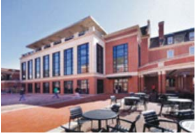
Oklahoma State University, Student Union