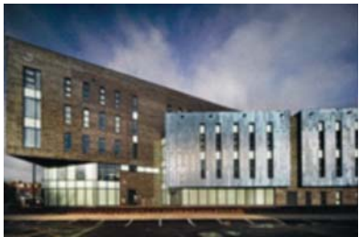
University Centre at Blackburn College