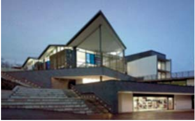
University Centre Hampshire, England, UK