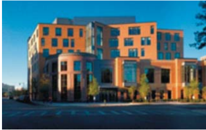
Boston University, Student Services Center