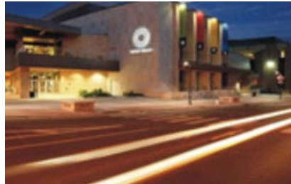
University of Wisconsin, Union South