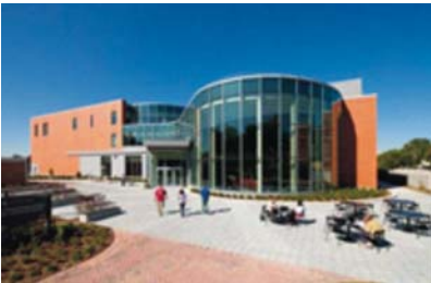
Hamline University, Anderson University Center