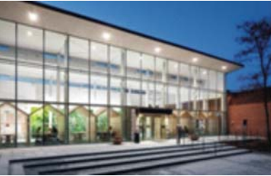
Karolinska Institutet – Future Learning Environment Solna, Sweden