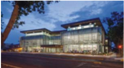
New Mexico Highlands University, Student Center, Las Vegas