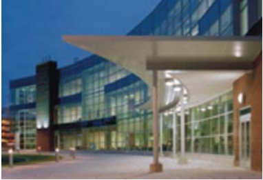
Eastern Michigan University, Student Center