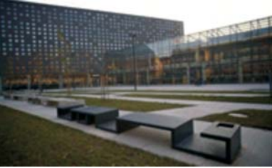
The Integrated Student Center, Wroclaw University of Technology