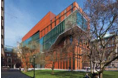
Barnard College – Diana Center New York, NY