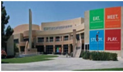
California State Polytechnic University, Bronco Student Center