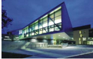
Scarborough Student Centre, University of Toronto