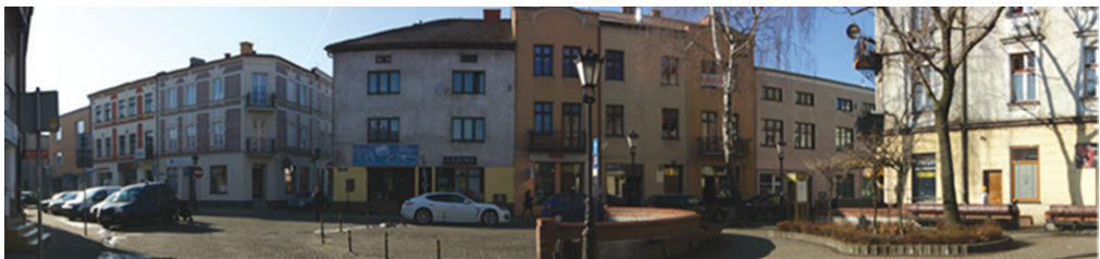
Fig.10. Oświęcim. Renovated corner townhouse on the corner of Klasztorna Street and the Small Market Square (photo by K. Paprzyca, 2015) (source: [23])