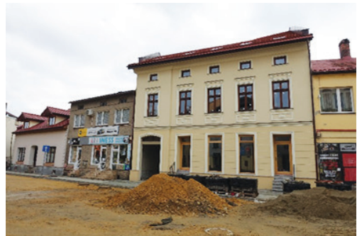
Fig. 11, 12. Townhouse at the Small Market Square in the year 2014 and the year 2017 (photo by K. Paprzyca, 2014, 2017)