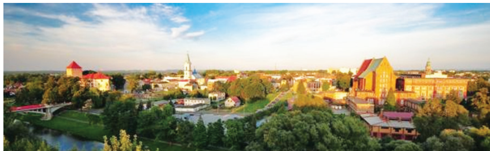
Fig. 2. Oświęcim – Old Town – panorama

Oświęcim is an old town, with a tradition going back 800 years. Its urban layout and the historical sites of its Old Town section are a monument to history (Fig. 1, 2). One consequence of this situation are difficulties with access to individual public spaces, public services, as well as the necessity of significant costs associated with the development of public infrastructure. The Old Town is characterised by a poor technical condition of buildings and was characterised by a poor state of technical infrastructure up until the time of the Old Town becomes renovated. This state of affairs is the result of an uneven development of the city, as well as the age and construction technology of the buildings.