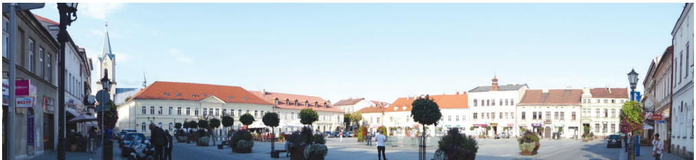
Fig. 3, 4. A view of the modernised Main Market Square in Oświęcim

Thanks to the investment meant to improve the quality of public spaces that were made, the Old Town of Oświęcim has become a hallmark of the city, a place where the most important cultural events are cyclically held (Fig. 5–8).