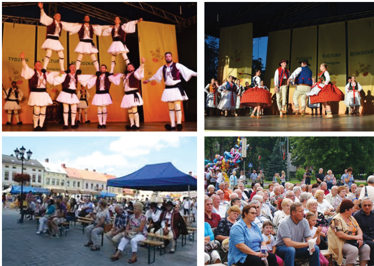
Fig. 5–8. Cultural events on the surface of the Main Market Square of Oświęcim

Thanks to the investment meant to improve the quality of public spaces that were made, the Old Town of Oświęcim has become a hallmark of the city, a place where the most important cultural events are cyclically held (Fig. 5–8).