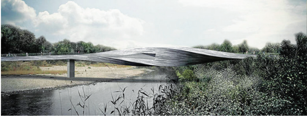
Fig. 16. Bridge of Ghosts | Histories of Oświęcim

and Adam Lambert (2016), Eric Clapton (2014), Soundgarden (2014), Jesse Ware, UB40, Sting (2013) and Peter Gabriel (2012) (Fig.17) [27].