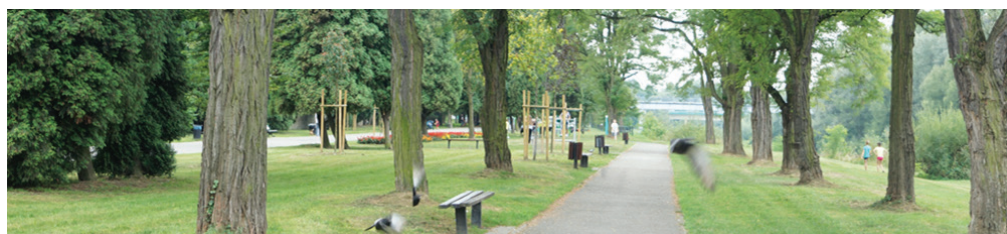
Fig. 15. The development of the area along the Soła River

Access to green areas that offer rest and recreation has considerable influence on the quality of life within a city. Oświęcim is characterised by a high amount of greenery which is present in various forms: parks, belts that accompany vehicular circulation routes, as well as a number of recreational areas, for instance the boulevards on the Soła River (Fig. 15).