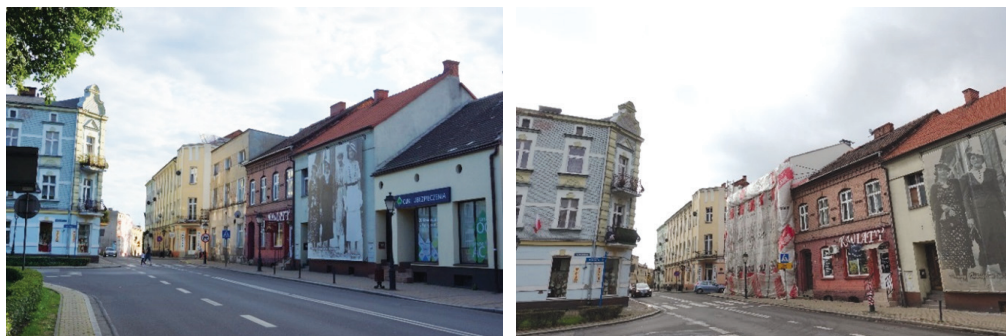
Fig. 13, 14. Townhouse on the corner of Sienkiewicza and Mickiewicza streets in the year 2014 and 2017