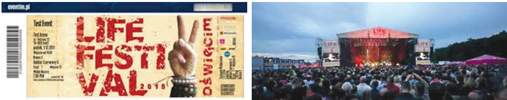
Fig. 17. Life Festival