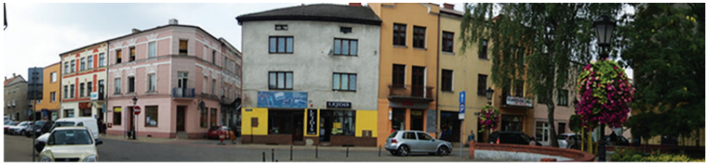
Fig. 9. Oświęcim. A vandalised corner townhouse near Klasztorna Street, as well as an abandoned building near the Small Market Square

The age of the buildings of the Old Town leads to the necessity of carrying out renovation, redevelopment, modernisation and replacement works associated with the technical condition of the buildings and their installations (Fig. 9–14).