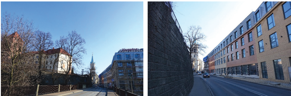
Fig. 18, 19. Entryway to the Oświęcim Old Town, a view of the Hilton Hotel being built

Utilising the historical and cultural potential of the city to increase tourist traffic requires the allocation of resources in development. The Hampton by Hilton Hotel is being built near the entryway to the Old Town, near the Piast Castle. (Fig. 18, 19). It is to house 40 thousand guests per year. The building is being built at the site of the no-longer existing townhouse and the Jakub Habercfeld Vodka and Liquors Factory. “This is going to be the first such building in the centre – Marcin Susuł from the Oświęcim-based company Susuł&Strama Architekci, which is responsible for the design of the building, told “Gazeta Krakowska”. The hotel is