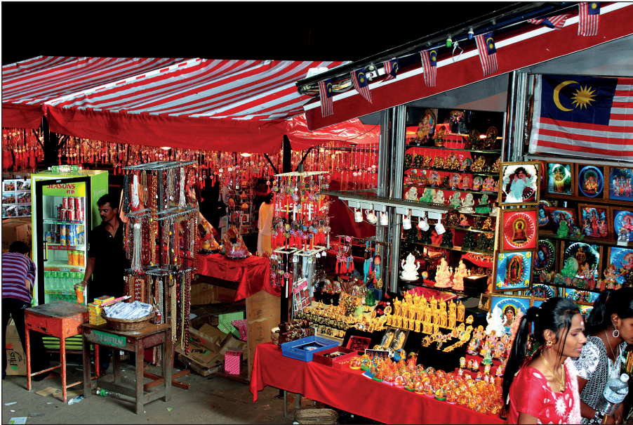
Photo 3. Small souvenir shop with devotional items inside the great cavern in Temple Cave (Gua Kulil)