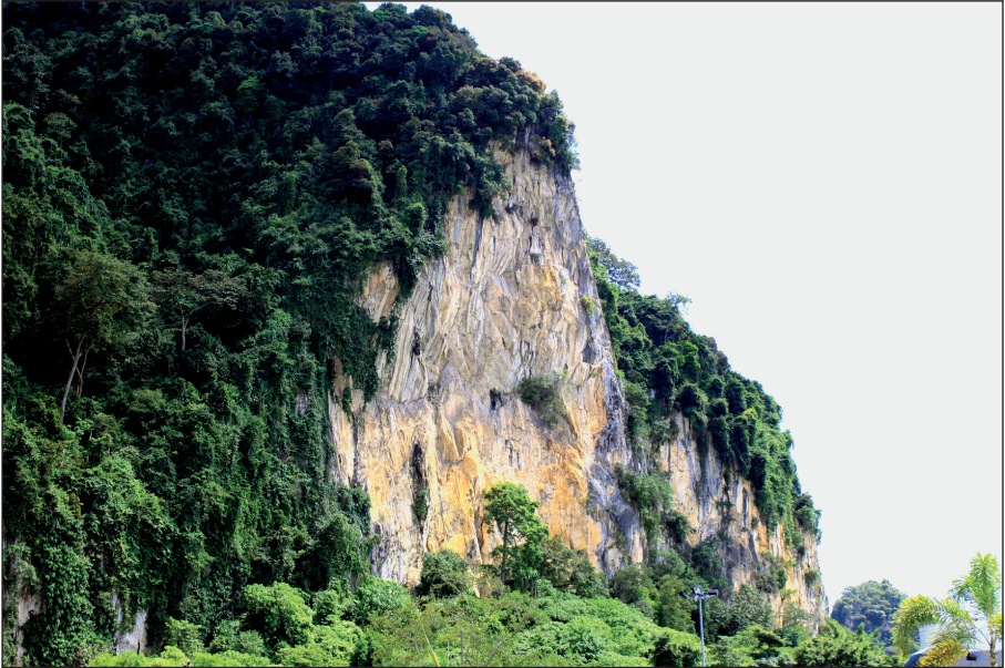
Photo 1. Vertical limestone rocks of Batu massif are used by amateurs of adventure tourism