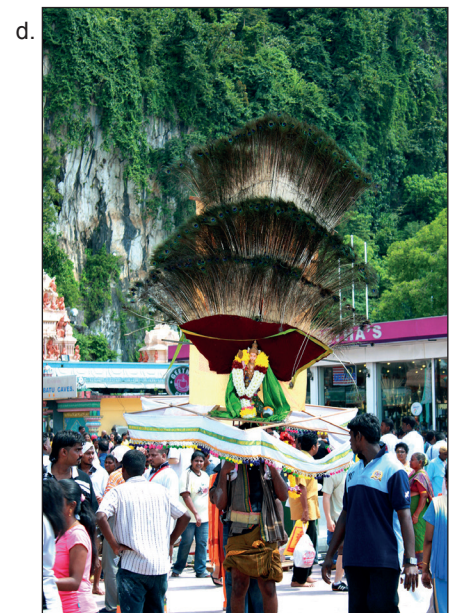
Photo 4. Kavadi may have various shapes, colours and sizes, which greatly depend on the sex and the age of a pilgrim