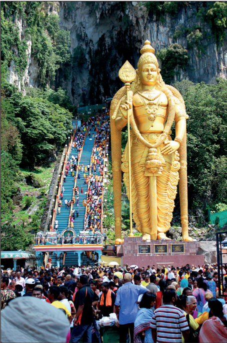
Photo 2. The world's tallest statue of Lord Skanda and steps for pilgrims leading to Temple Cave (Gua Kuil) and Dark Cave (Gua Gelap)