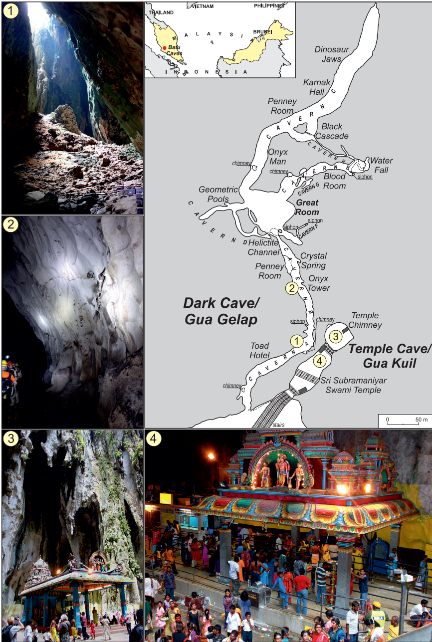
Fig. 2. Plan of Temple Cave (Gua Kuil) and Dark Cave (Gua Gelap): 1 – Karst shaft in corridor A in Dark Cave, 2 – Part of corridor B in Dark Cave, 3 – Karst shaft lighting Temple Cave, 4 – Sri Subramaniyar Swami temple inside Temple Cave