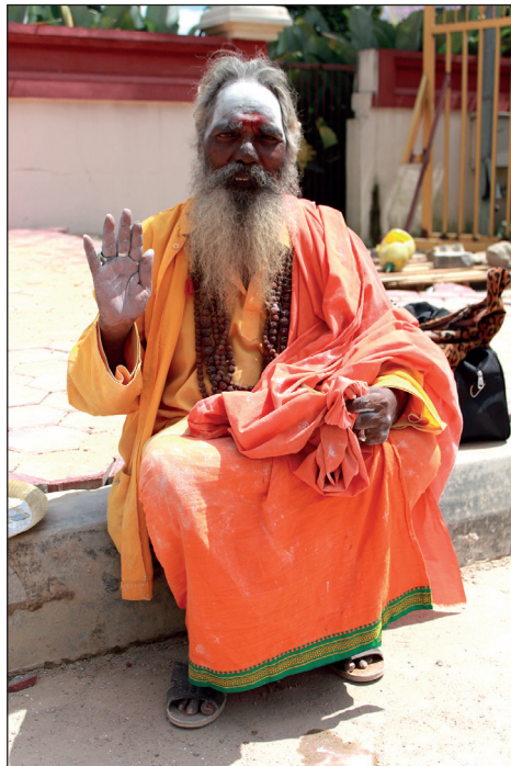
Photo 5. Sadhu – Hindu sage/ascetic blesses pilgrims, sprinkling their heads and foreheads with white ash